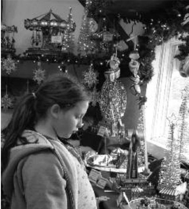
Glittering wonders enthrall a young visitor to the Poundridge Nurseries and its dazzling holiday store.

Your holiday dreams will come true right in your own hometown by visiting our creative Pound Ridge sources for entertaining, decorations and more.