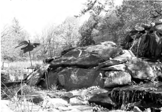
A water cascade and rock garden provide movement, sound and excitement. Selecting plant material and design elements for your garden is intriguing and rewarding at Poundridge Nurseries.