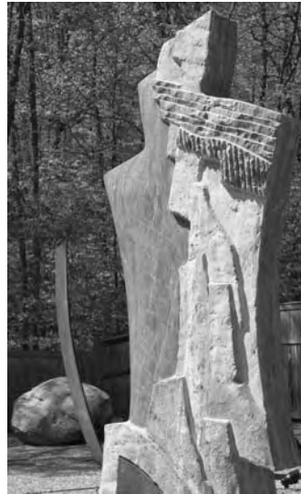
Granite Sculpture by William Royell at Avantgarden

A beautiful garden incorporates a pleasing balance of form, function and decorative plantings with realistic maintenance. Focal points such as water elements, terraces or containers contribute variety and texture.